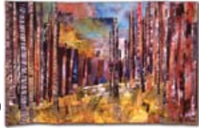
Getting Used to Dying Trees 2006 Patty Hawkins

For more about Patty, see www.pattyhawkins.com