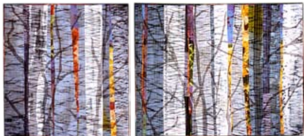
The Light of Day (2005) Patty Hawkins Quilt Japan Prize 2007