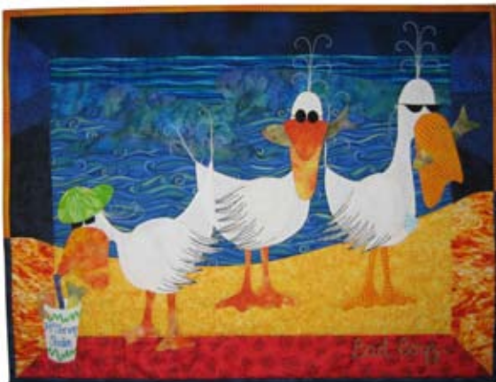
Bad Boyz by Kelly Gallagher-Abbott Pattern $8.95